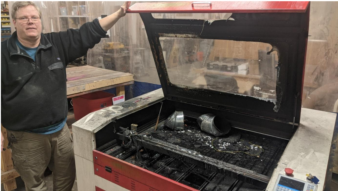
Day 1 – Laser delivered (proof that lasers do catch fire)