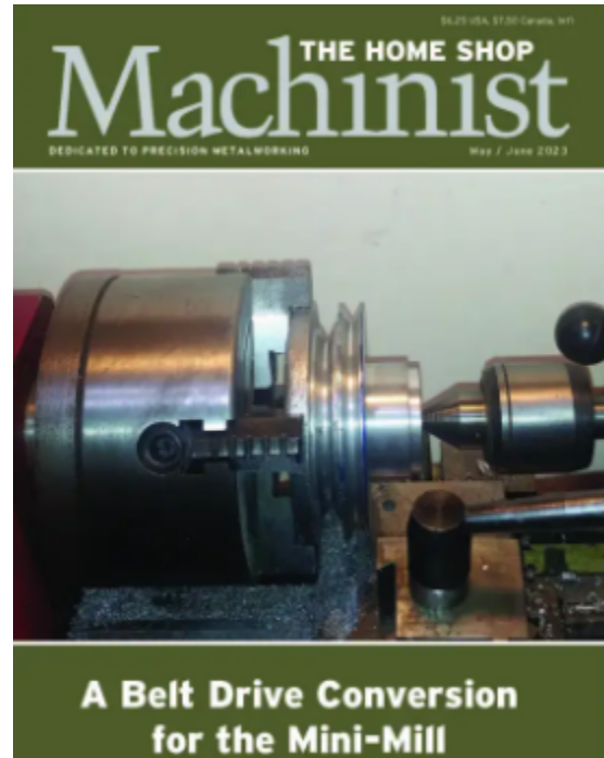
Home Shop Machinist